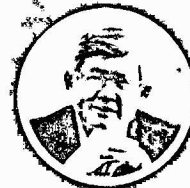
Dr. Suwit Maesincee Former Minister of Ministry of Higher Education, Science, Research and Innovation